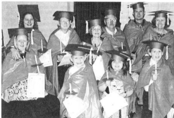
Class graduates! Just look at the range of ages represented. Congratulations "New Dancers"!!