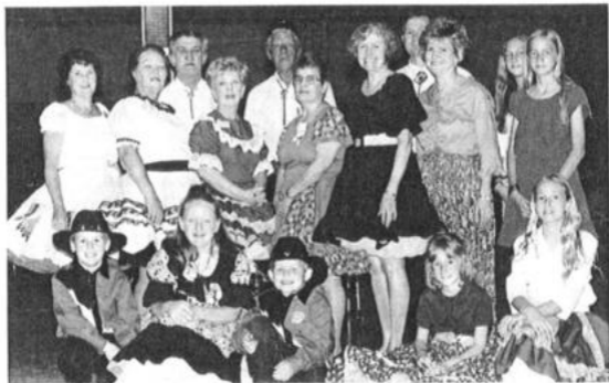
Students attending the Graduation Ball!