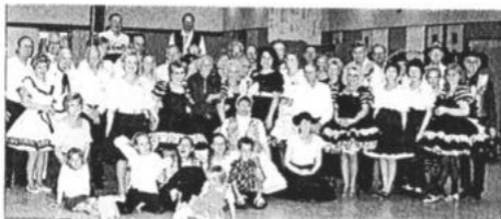
← Club members relax from dancing for their Anniversary Picture!

Well, we have stopped to smell the roses long enough for now, so we have to get going. We have a busy schedule planned for the next year and we are really looking forward to it.