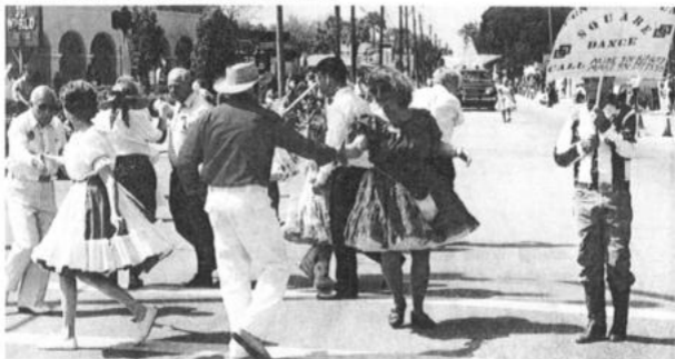
Joy Seas members and others perform at the Annual Easter Parade in St. Augustine!

Hats off to Southeast Square Dance Association for a wonderful State Convention, and to all the callers and cuers that gave their time to make it possible. For those of you who missed it this year, try to make next year. Each year is better and better. There is something for everyone from Beginners to A2, Rounds from Intro to Phase V. There's also Clogging, Contra, Lines and Country Western Dance. We had a great time and tried to do it all and found out it was impossible, but we had fun trying. Thank you one and all for a great and wonderful weekend!