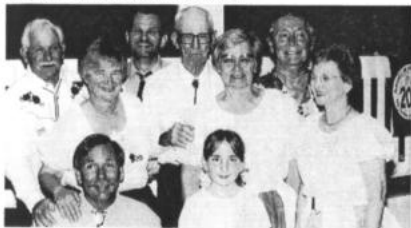
▼ Joy Seas members pose for their 9th Anniversary pictures. ▲

We dance every Thursday night at the Beach Club in St. Augustine...right on the ocean. Check The Grapevine Directory for directions and come join us anytime. Hope to square up with you soon!