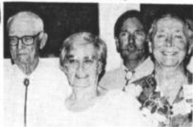
Joy Seas charter members help the club celebrate their 9th Anniversary!