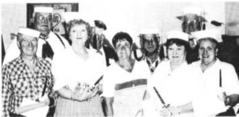
Moose Promenaders' Graduates' graduation night. CONGRATULATIONS!!

Remember we dance on Thursday evenings at the Moose Lodge on Collins Road. From now until the end of July we have a Plus level workshop from 7:00 pm to 8:00 pm. You do not need to be a Moose member to come and join in on all the fun. See you soon!