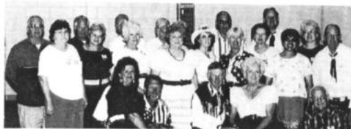
Sweet Art Squares at their final dance, May 30, 2000, after 25 years of Square Dancing!

We are sure to see you in Jacksonville for the 4th of July parade and other things that we as a group can join. We are not stopping Square Dancing but joining others for sure. The place to be may not be Yulee but we will bring our Yulee friends and see you in your squares.