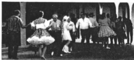
Club members (+) perform outside the Alhambra Dinner Theater while waiting for the show to start!