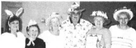
The "ladies" of Fun 'N Frolic show off their Easter Bonnets.