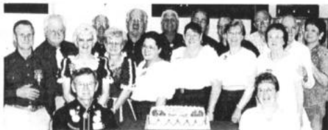
↑ Club members at their 15th Anniversary Dance.