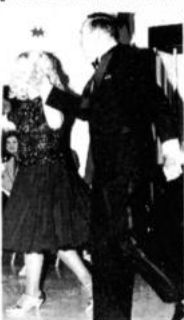
Fred Astaire and Ginger Rogers took a "twirl" around the dance floor!!