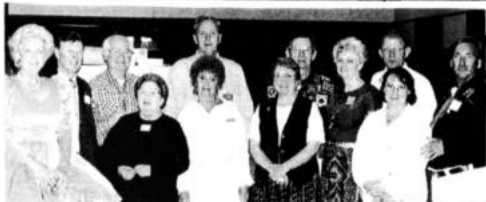
Callers and Taws line up for a picture at the Graduation Ball.