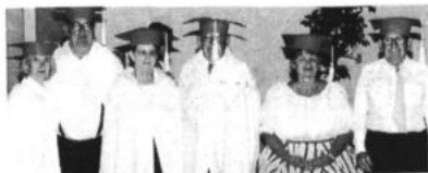
↑ Some of the River Ramblers Graduates!