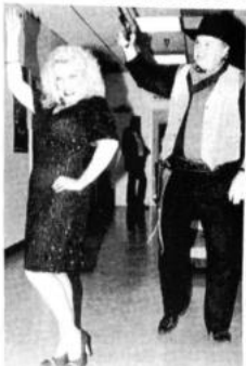
Dolly Parton and her "bodyguard" made an "outstanding" appearance!

Here are the last pictures from the Fall Festival Parade.