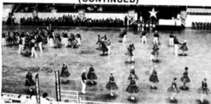
DANCING'S THE RAGE IN THE NEW AGE!