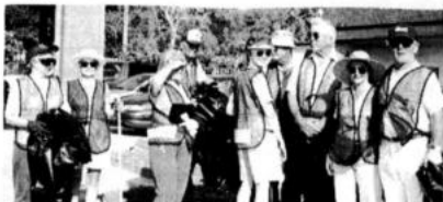
Joy Seas members get ready to "clean up" the highway!