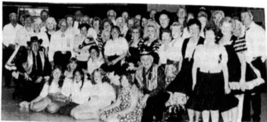
↑ The Rollaways club members at their 11th Anniversary Dance!