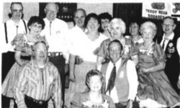
Teddy Bear Squares club members at their 15th Anniversary Dance!

If you have been left out of the news, please let us know as we cannot print what we do not receive. Thank you!