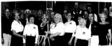
Mandarin Marauders members pose for their 14th Anniversary pictures!