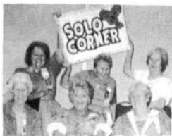
At the Convention! ↑