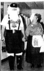
Santa & Mrs. Claus left the North Pole to stop for a visit!