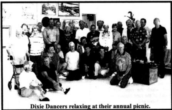
Dixie Dancers relaxing at their annual picnic.

It is approaching time for The Blue/Grey Dance again. This year, as I am sure you have heard, we have a new location for the dance and hope you will all come help us make the change. The dance will be held at the beautiful inside showroom of Roundtree Moore Toyota. We are very pleased they are allowing us to use their facility. Don Handhurst will be the caller for the dance. The rounds will be done by Lisa Wall and Ralph Beekman. Our caller is the one and only Bill Chesnut. The dance is scheduled for February 17, 2007. You can view the pictures from the 2006 dance and check out the pictures of the new location for the Roundtree Moore Toyota Showroom in Lake City, Florida. Give us a visit at www.dixiedancers.net . Hope to see you at the dance.