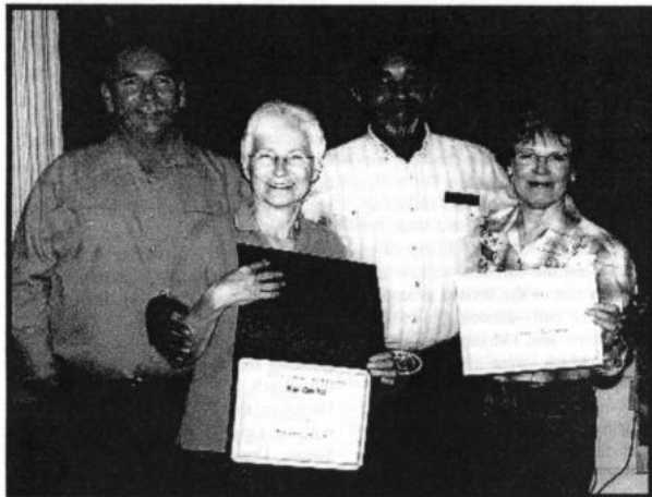
New graduates of the Joy Seas Square Dance Club