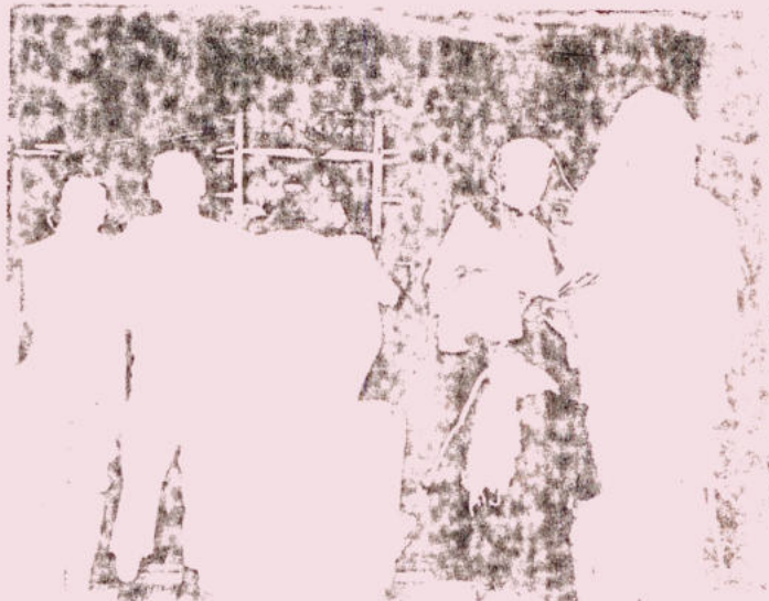
Costume winners at the Statlite Shufflers Halloween Dance.