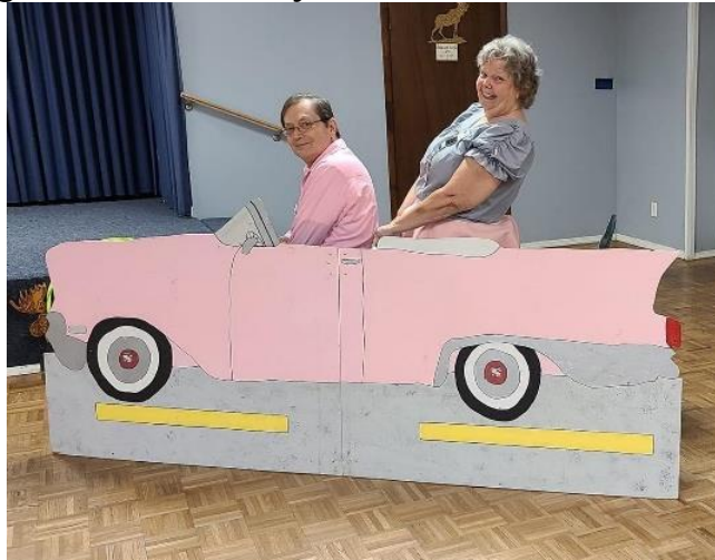
Soon they began to motor around the floor .