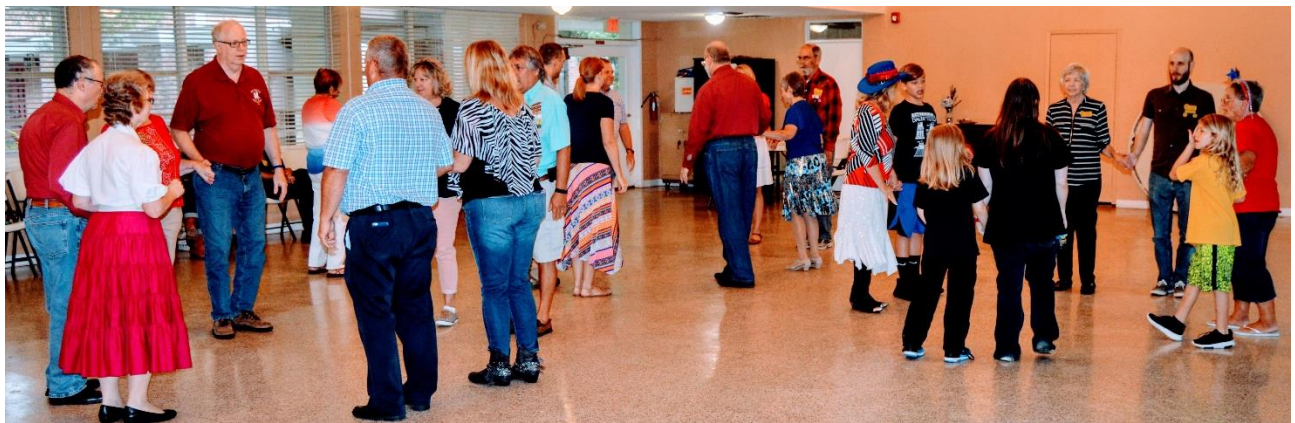
Rollaways Firecracker Dance