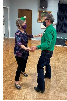
We also enjoyed ourselves at our regular dances.