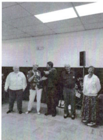
February Birthday Photo