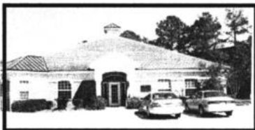
Home of "Dreams Come True"