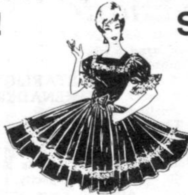
ELAINE THACKSTON NATALIE FAVRE - OWNERS