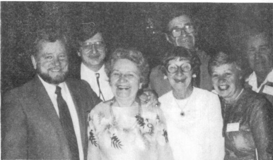
CENTRAL FLORIDA CALLERS IN ATTENDANCE AT CALLERLAB CONVENTION IN PHILADELPHIA