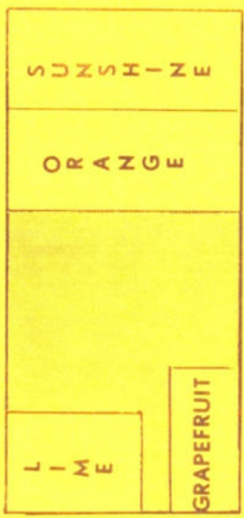
CONFERENCE HALL LAYOUT