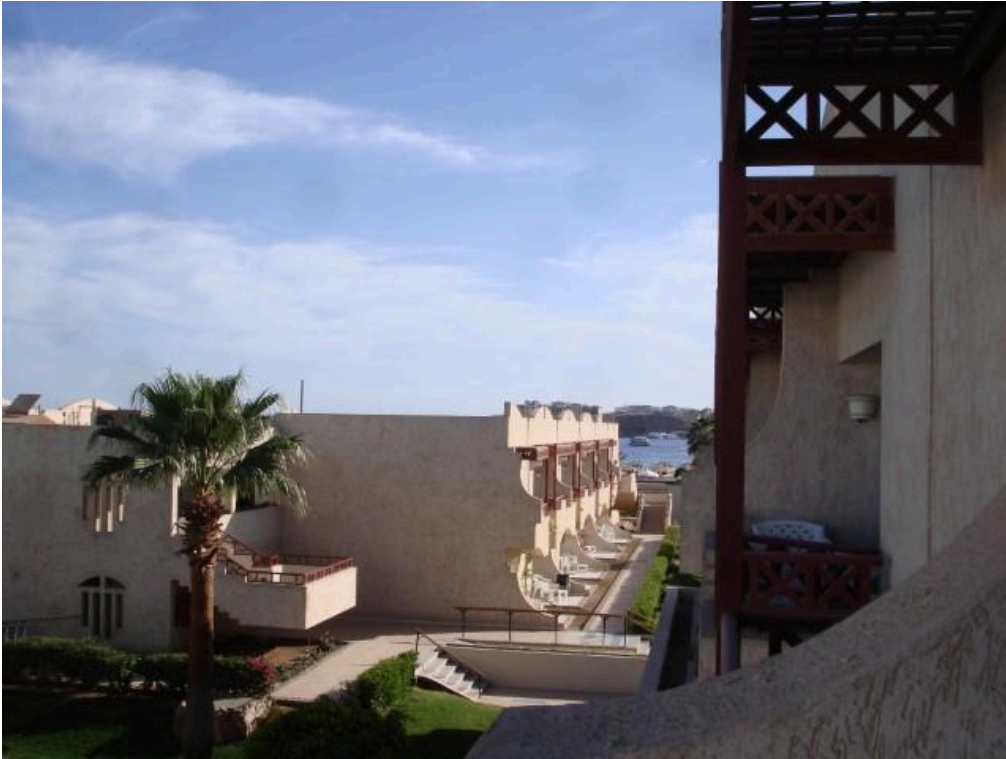
Saturday March 16